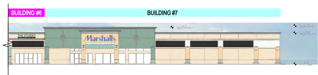
2 PARTIAL SITE ELEVATION - SOUTH SCALE: 1/16" = 1'-0"